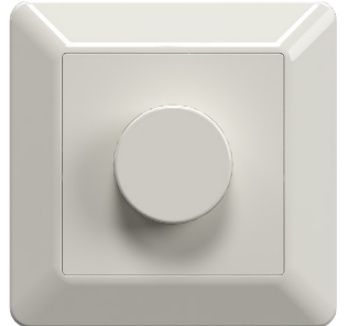
White RAL 9010