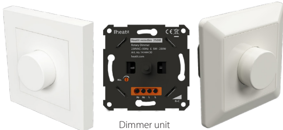
1x White RAL 9003 plastic kit